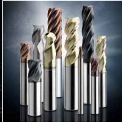
High-Performance Carbide Round Tools