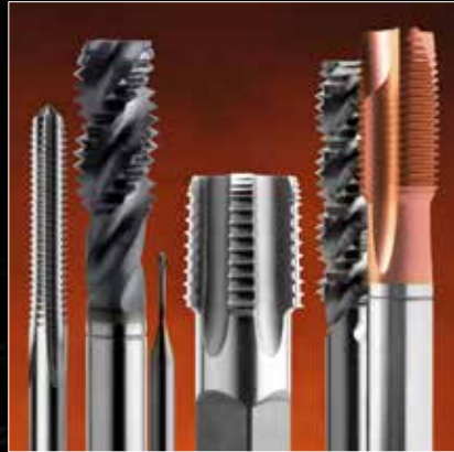
High-Performance, Special and Standard Taps and Threading Tools