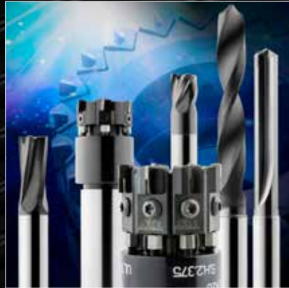
Your Trusted Source for Diamond, PCD, and PcBN Cutting Tools